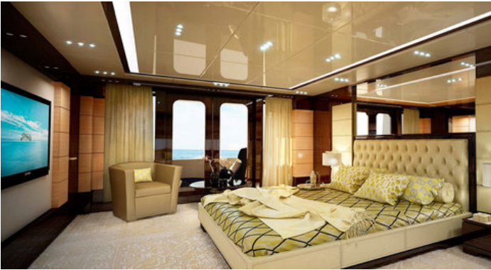
Master Suite with balcony