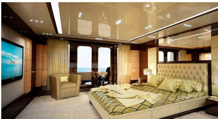
Master Suite with balcony