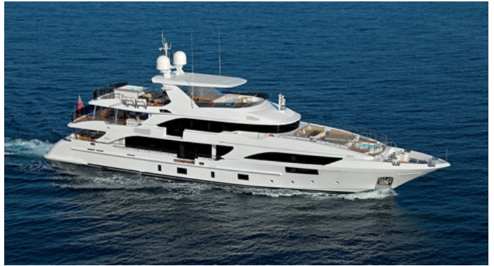
Экстерьер Benetti Supreme 132