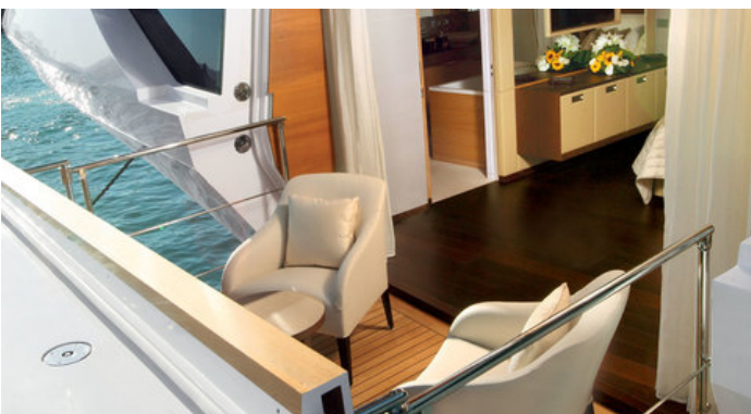
Балкон в каюте владельца