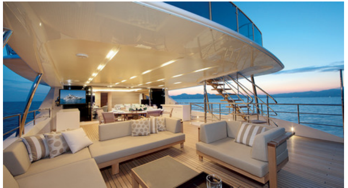
Кормовая часть верхней палубы