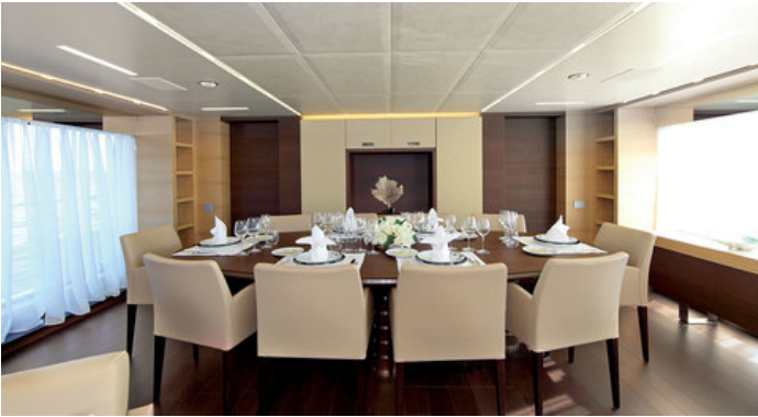
Обеденная зона в салоне на главной палубе