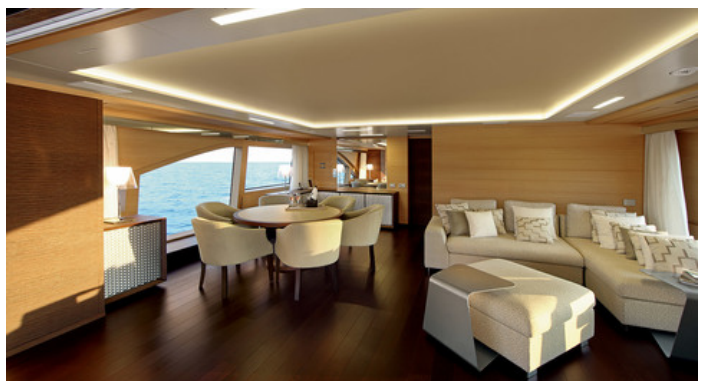
Салон на главной палубе