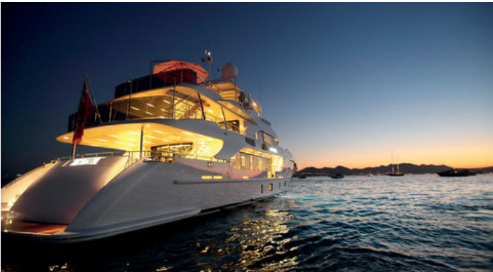
Экстерьер Benetti Supreme 132