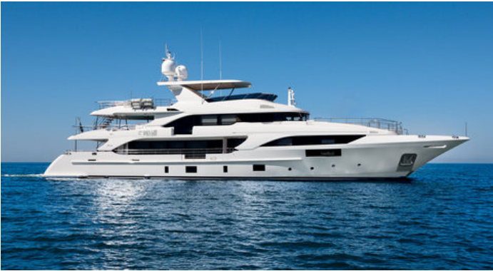
Экстерьер Benetti Supreme 132