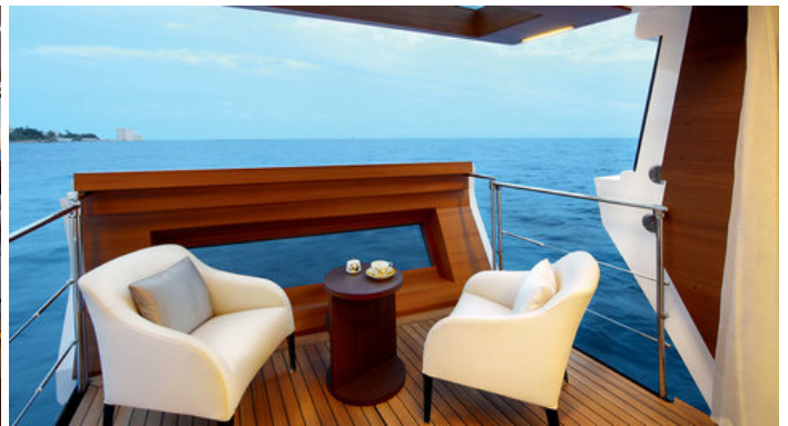
Балкон в каюте владельца