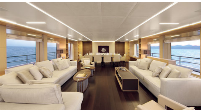
Салон на главной палубе